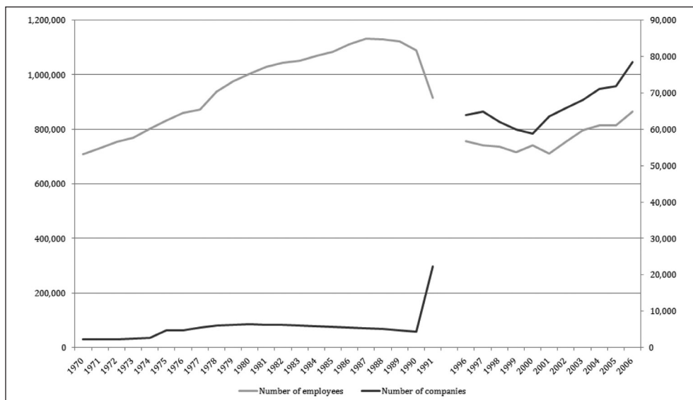
Picture 1: Number of enterprises and employed in Croatian economy in chosen industries in the period from 1970-2006