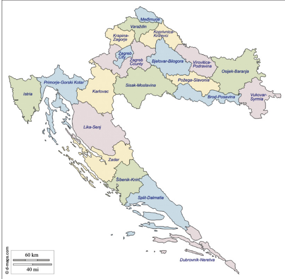
Map of Croatian NUTS III regions (counties)