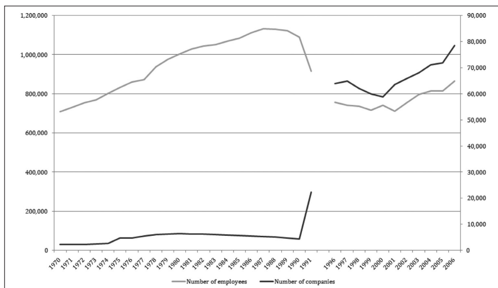
Picture 1: Number of enterprises and employed in Croatian economy in chosen industries in the period from 1970-2006