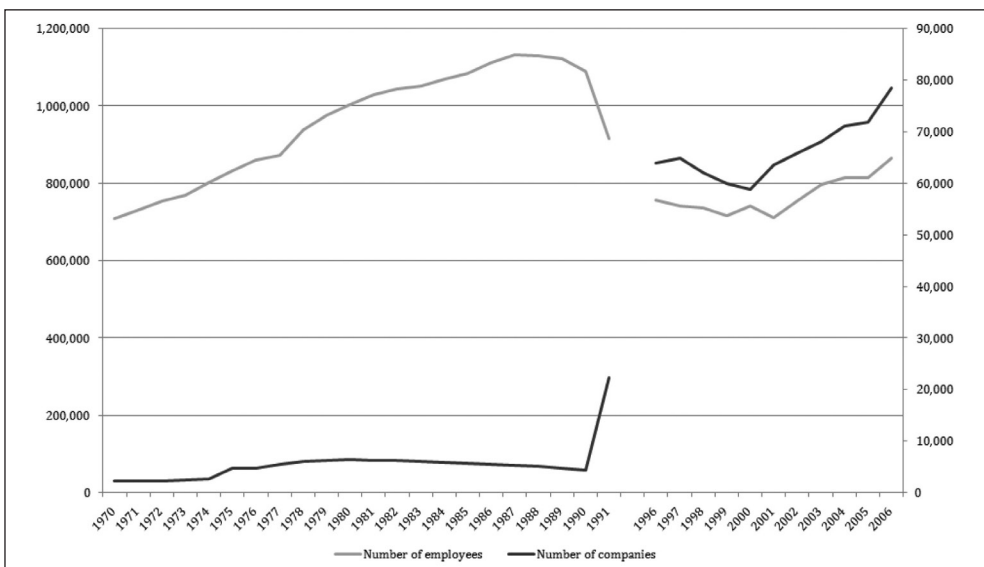
Picture 1: Number of enterprises and employed in Croatian economy in chosen industries in the period from 1970-2006